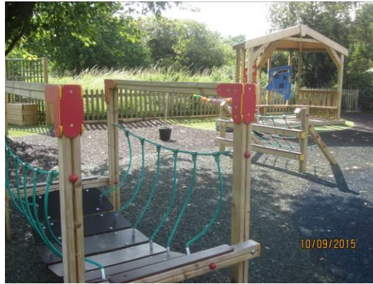
Outdoor Reception area

We have an immensely dedicated team of teachers and support staff whose experience, expertise and efforts make the school come alive. We enjoy an enviable partnership with our Governors and parents and we have Friends of Little Reddings (FLR) which works exceptionally hard to raise money for the school.