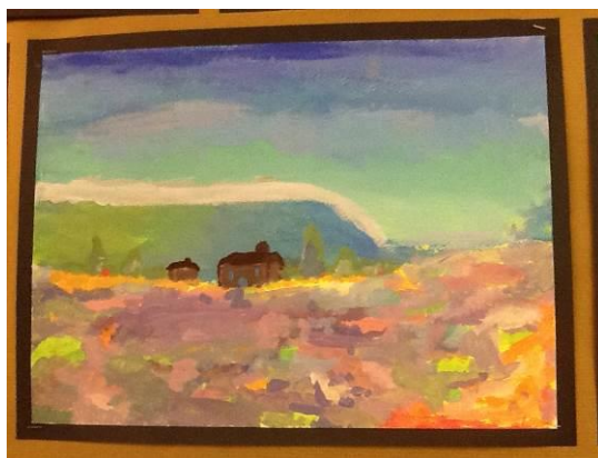
Y6 Impressionist art

At Little Reddings children are encouraged to stimulate their imaginations and creativity through Art and Design. They study different sorts of artwork such as murals and sculptures. They also learn how art, craft and design can enrich their lives by developing a love of art and being encouraged to discuss how it makes us feel and think.