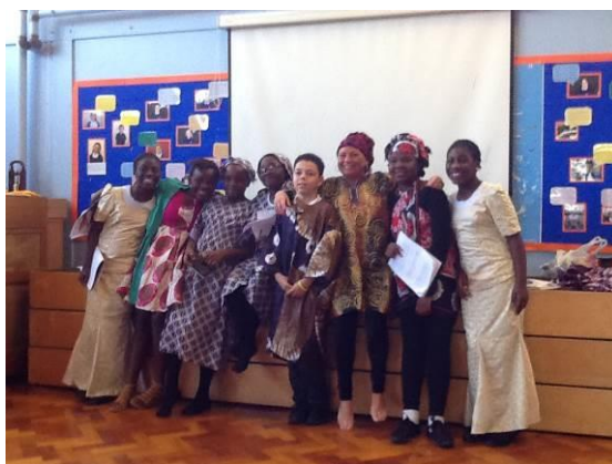
Celebrating different cultures in assembly