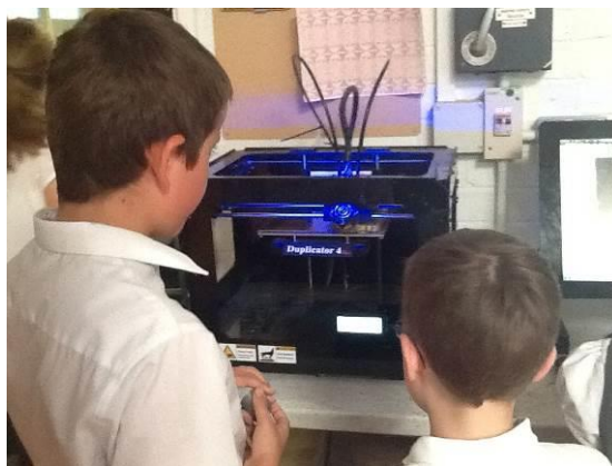
3D printing at Bushey Meads

At Little Reddings we give children the opportunity through Design and Technology to investigate how familiar products and objects actually work. By answering questions such as 'is this the right tool for the job' they learn how to solve practical problems skilfully, creatively and with imagination.