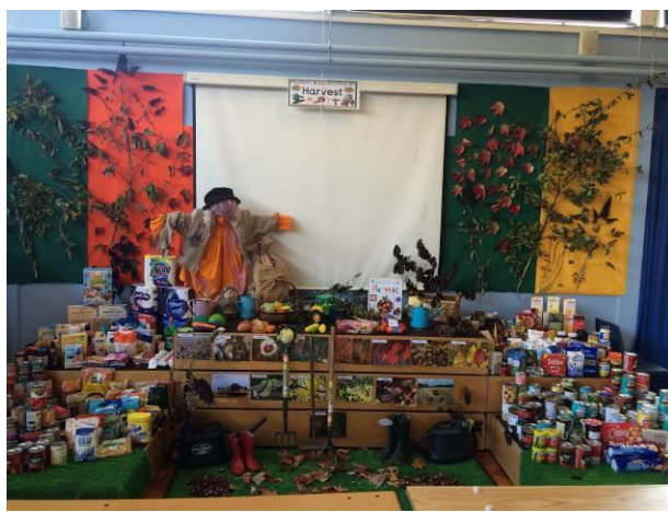
Contributions for our Harvest assembly