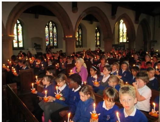
Christingle service at St.James church