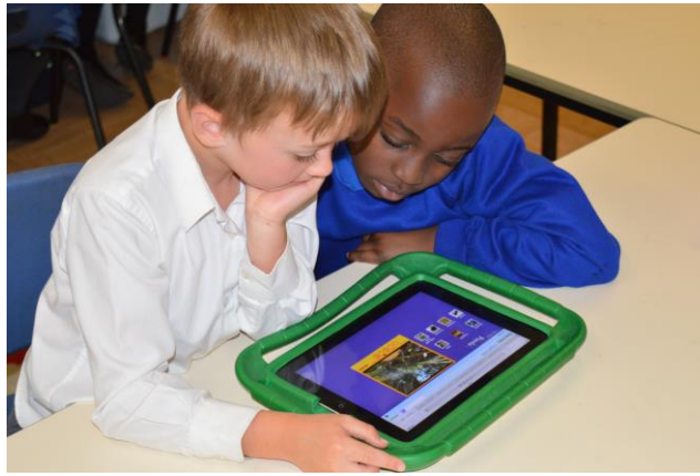
Technology supporting learning at Little Reddings

Computing is an essential and continually developing part of our curriculum. We believe strongly that for children to function in the wider world they need to be confident and able to use the most up to date technological devices. Each classroom has at least one computer and in addition to the Computing suite (of 16 PCs) and the 2 class sets of iPads. Children are also encouraged to use digital cameras, interactive whiteboards, music stations, roamers as well as many other forms of technology.