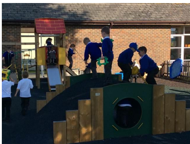
Learning through play

*We currently offer a 30 hours Nursery week which can be arranged either through the school office. This can be funded either through a 30 hours code from the DFE or by private payment if you do not qualify for a 30 hours code.