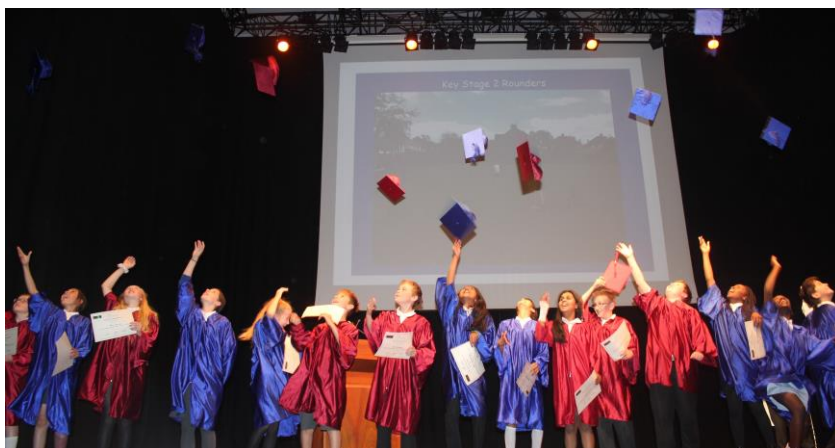
Children's University graduation

Our club provision is supported by our involvement with the Children's University. By taking part in school clubs, our students collect accreditations towards our Children's University graduation. Last year, this grand event took place at the Watford Coliseum.