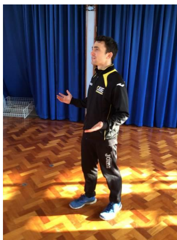
Specialist sports coaches

At Little Reddings we know how important keeping fit is and try to instil the importance of regular exercise in the children. In Physical Education, children learn that it is fun to stay in shape and that everybody's contribution is of value. The children also learn important skills such as to prepare for and recover from exercise and what happens to their body when they exercise.