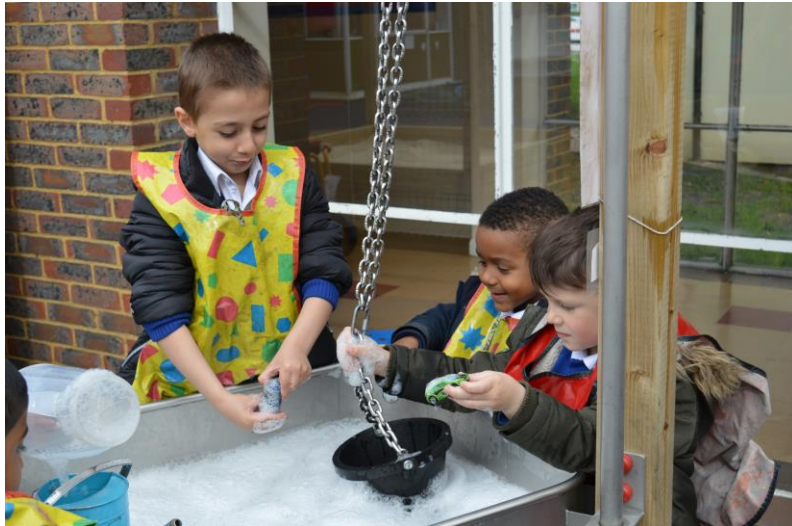
Early Years Provision

At Little Reddings, we are all very proud of our school. We are known for providing a welcoming and caring atmosphere where children learn confidently in happy surroundings. Great care is taken to provide for the social, moral and educational needs of the individual child. Our school is a place where mutual respect is encouraged and opportunities for challenge are provided.