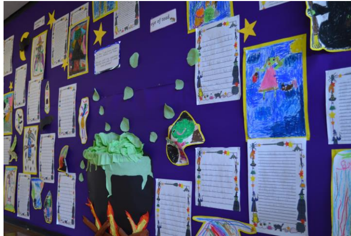
Cross curricular writing through Cornerstones curriculum