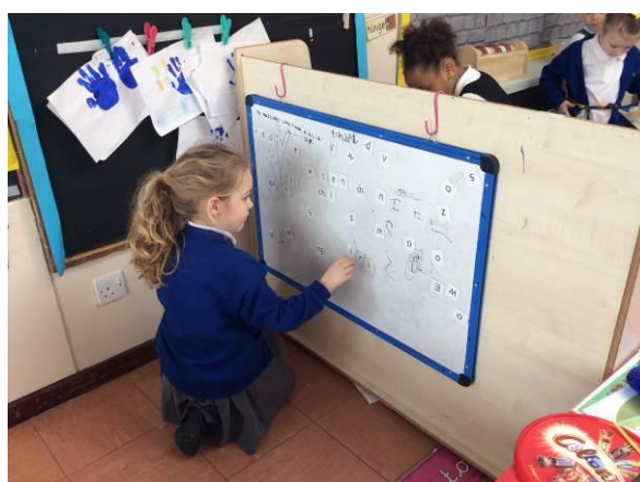
Reception phonic work

Handwriting: We teach our children a simple a continuous cursive style of handwriting. This means that they are taught each letter with a 'lead on' and 'lead off'. This policy results in a high standard of handwriting both in its speed and appearance.