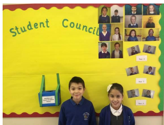
School council representatives

At Little Reddings, we have a well-established and popular school council. The children from each class vote for and elect two children to represent their views and concerns. Their term of office is for one school term and they meet fortnightly. One councillor takes minutes of the meeting and writes a short report which appears in the weekly newsletter and they have a display board with all of their information in the main school corridor.