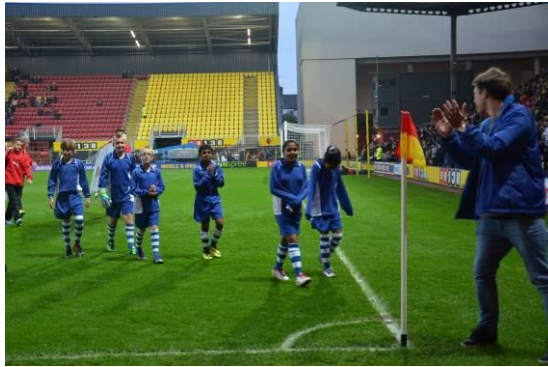
Half Term penalties at Watford Football Club