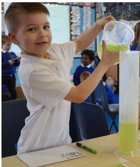
Cross curricular learning in KS1