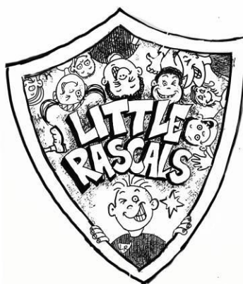
Little Rascals after school club

Please contact the school office for more information.